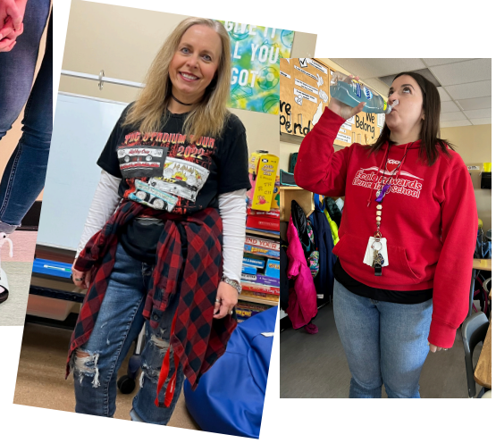
Look at those cute and wacky socks! Lots of purple outfits and radical-looking 80s staff! And some very unusual water or coffee cups!