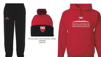
YOUTH and UNISEX everyday sweatpants. Direct to film right thigh. Available in Black CAD$27.75 - CAD$33.75